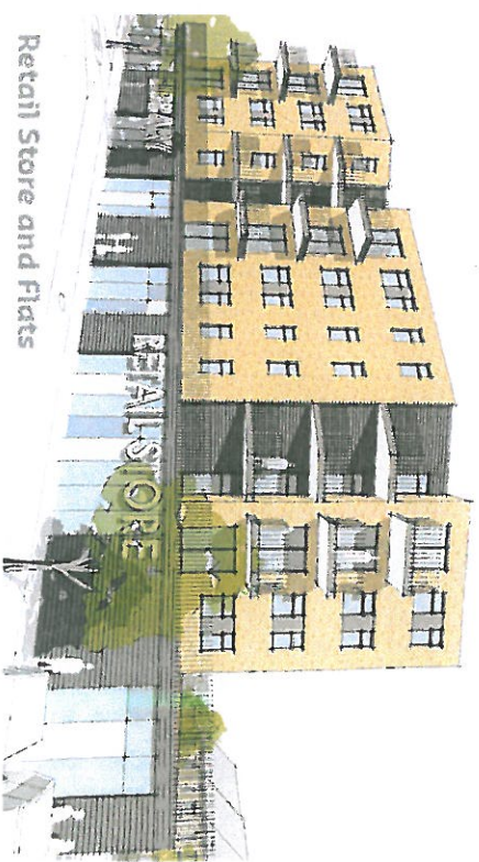
Retail Store and Flats