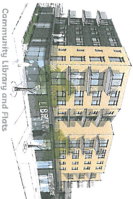
Community Library and Flats